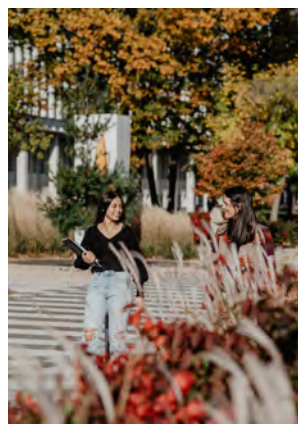
Dany Vachon / ULaval