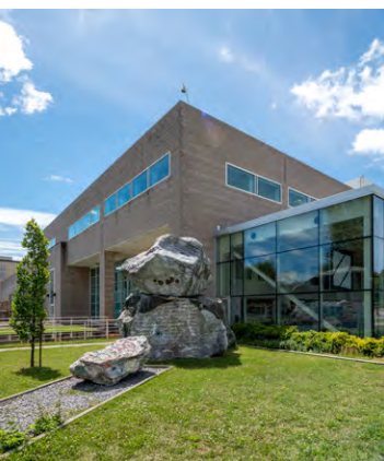
Dany Vachon / ULaval