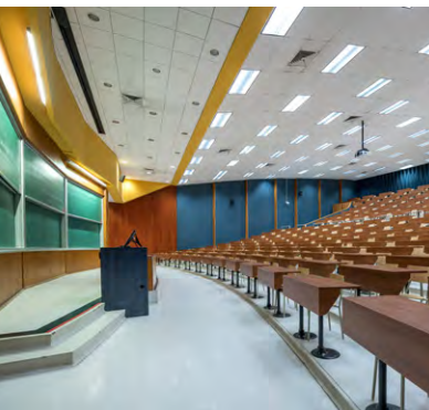
Dany Vachon / ULaval