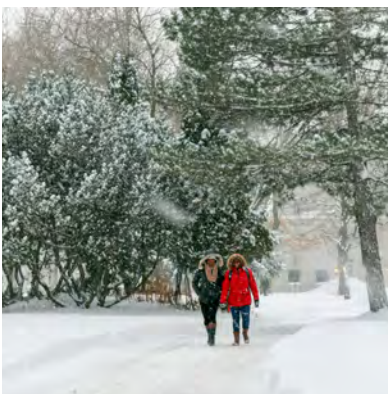
Pub Photo / ULaval