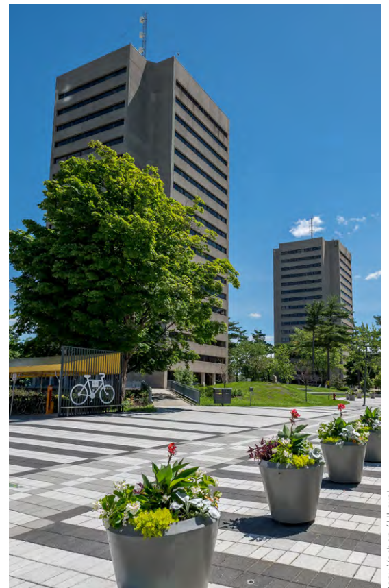
Dany Vachon / ULaval