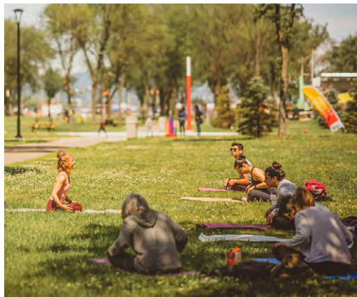
Mathieu Bélanger / ULaval